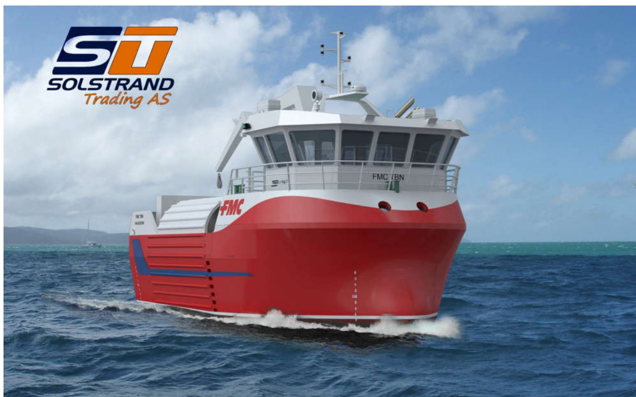
Illustration: Solstrand Trading AS

Built for: FMC Biopolymer AS Haugesund, Norway